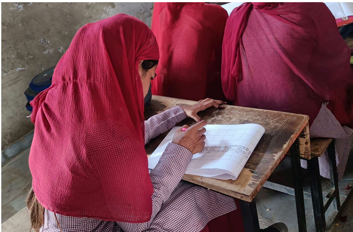
Girl doing Baseline Survey in KGBV Nagina

Look out for the release of our Baseline results on October 20, 2022!