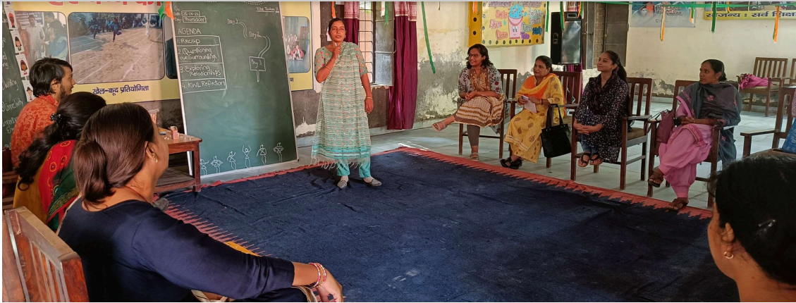
During Teachers' Workshop in KGBV Nuh