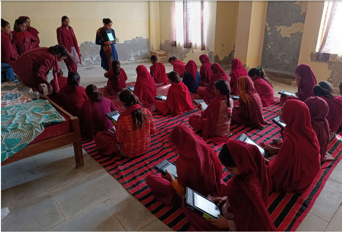
Girls doing tablet based Endline survey