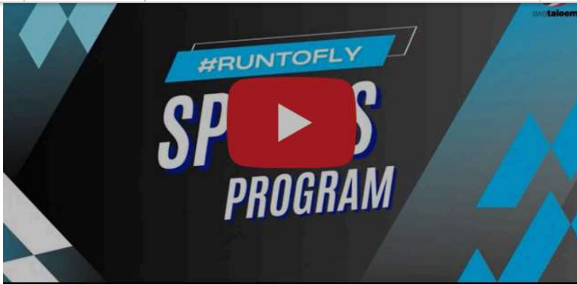
SwaTaleem's Sports Program- RunToFly updates