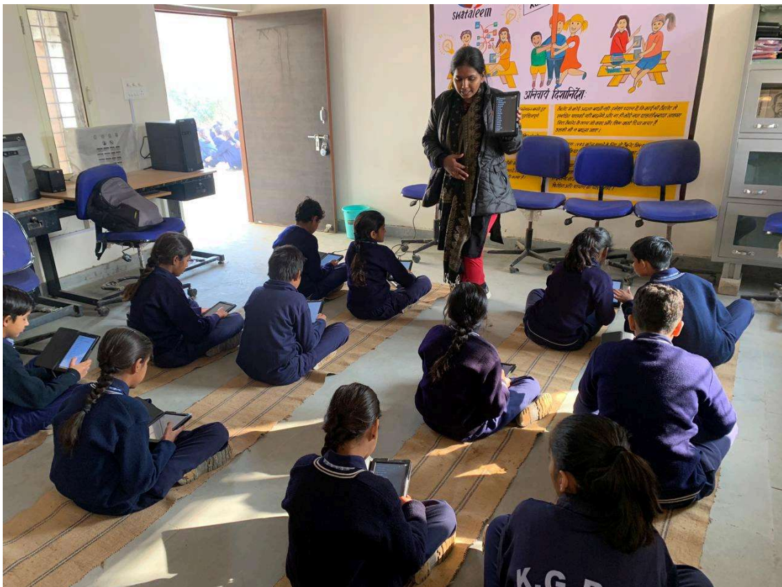
Girls doing tablet based Endline survey