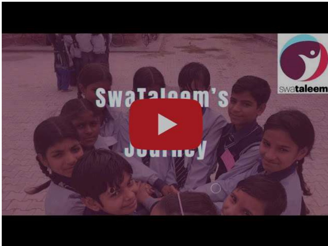
SwaTaleem's 5-year Journey!

Transitioning into the next phase of our journey, we are committed to move forward with greater resolve and grit. We hope to see the tribe of SwaTaleem grow in this mission of creating a gender equal world through education.