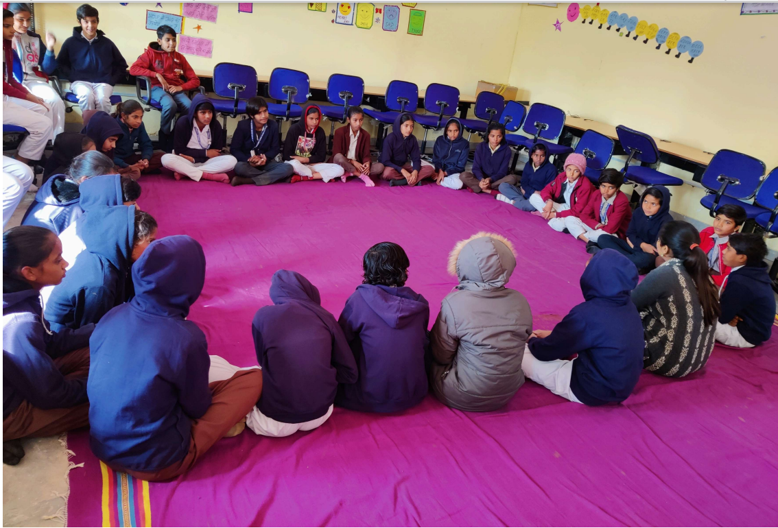
Our Field Coordinator giving Endline survey instructions to Girls